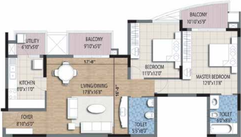
2 BHK Type A – 1322 sq. ft.