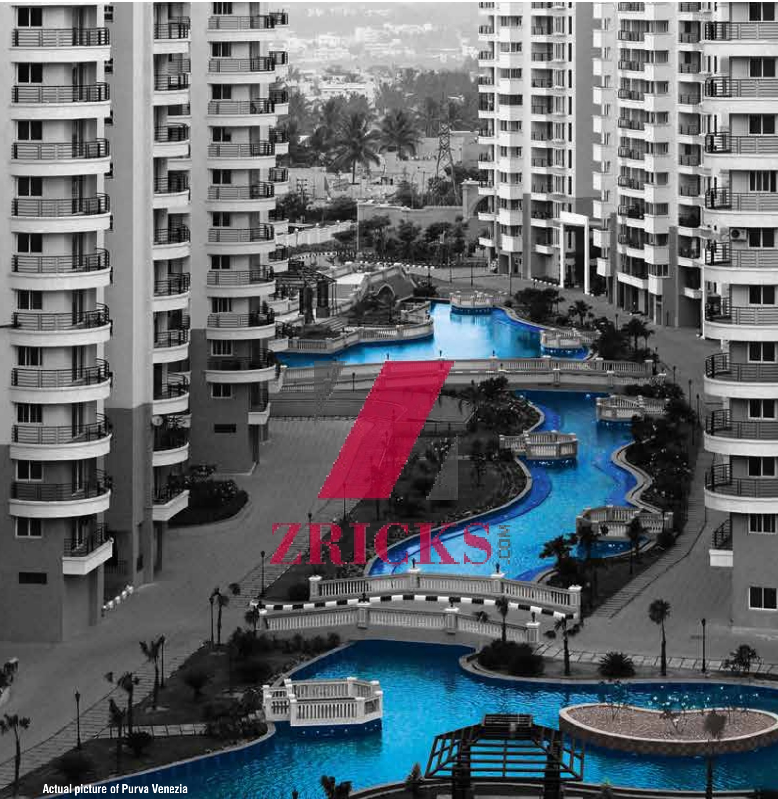
Actual picture of Purva Venezia

PURVA VENEZIA Luxury apartments, Yelahanka The spirit of Venice in Bengaluru