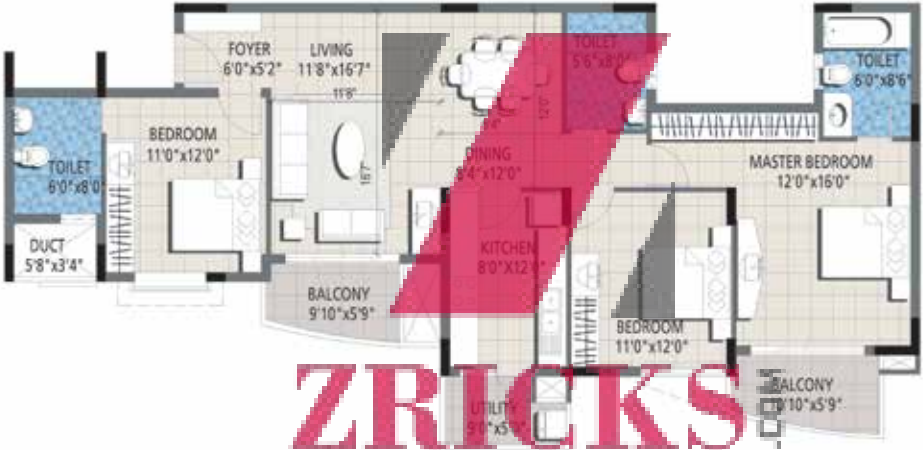
3 BHK Type C – 1610 sq. ft.